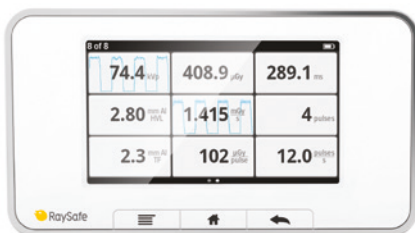
HOME SCREEN Measurement of 1 – 12 parameters simultaneously with waveform overlay.

All exposures are saved in the base unit. In each session, you can swipe to quickly go back to previous exposures for reference or comparisons. A full session of measurements can be uploaded to the X2 View software at a later stage for more manipulation.