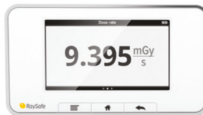
SINGLE VIEW Large view of selected parameter.