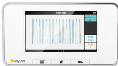
WAVEFORM Overview and simple analysis of kVp, dose rate or mA.